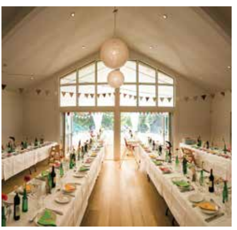
The Green is yours to personalise.